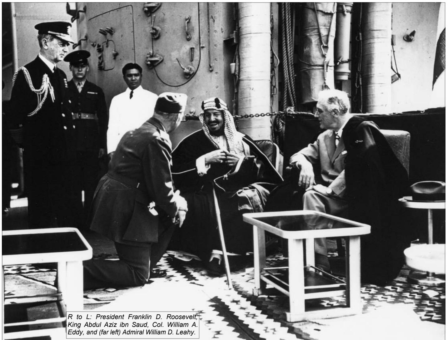
R to L: President Franklin D. Roosevelt, King Abdul Aziz ibn Saud, Col. William A. Eddy, and (far left) Admiral William D. Leahy.